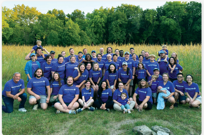
Wesley residents, faculty, staff and their guests participated in the annual team meeting Sept. 6-8.

KUSM-Wichita Family Medicine Residency Program at Wesley Medical Center conducted its annual team meeting at Rock Springs 4-H Center in Junction City, Kansas, Sept. 6-8. Residents and faculty kicked off the event by packaging food items for the Food-4-Kids program at the Kansas Food Bank before traveling to the 4-H center. During the retreat, residents and faculty participated in educational sessions including emergency simulations, culinary medicine and individual learning plans. Residents, faculty and their guests also enjoyed team-building activities, the culmination of which was the annual “Residency Olympic Games.”