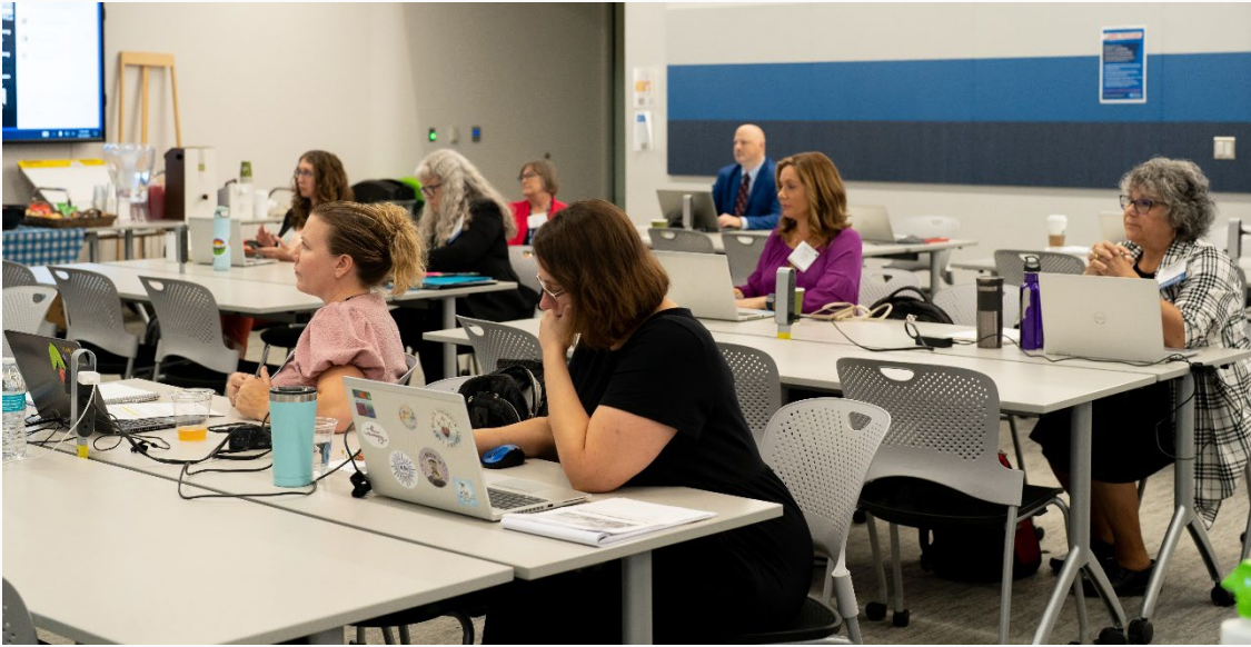
From Day 1 of the Symposium

ISPIN wishes to thank all attendees, presenters, and the planning committee for making this event a success. For those who were unable to attend or had to miss a session, recordings are now available to view on YouTube: