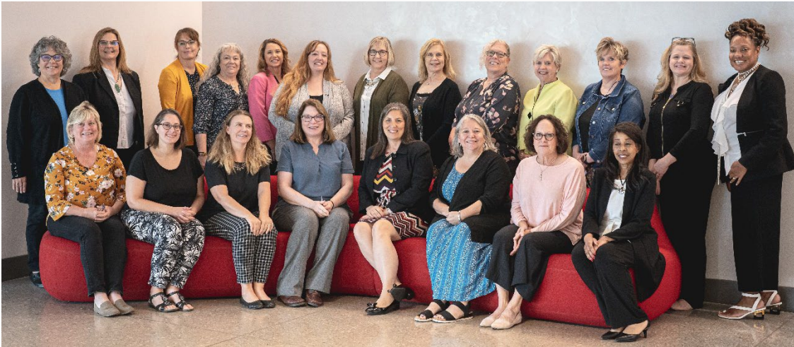
Symposium 2022 Attendees