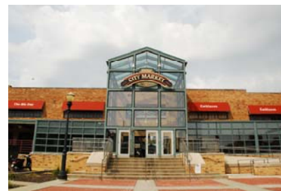
Kansas City Market

On Saturday morning, students met at KUMC for a trip to the City Market of Kansas City.