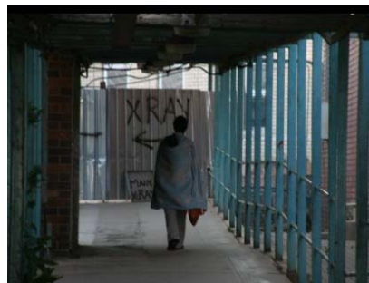
Chris Hani Baragwanath Hospital Johannesburg, South Africa

posters. The top 3 medical students' abstracts were presented to faculty, staff and students, followed by the poster presenta-