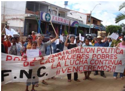
District Hospital of Santani Santani, Paraguay

On 20 April, senior nursing students who had traveled to