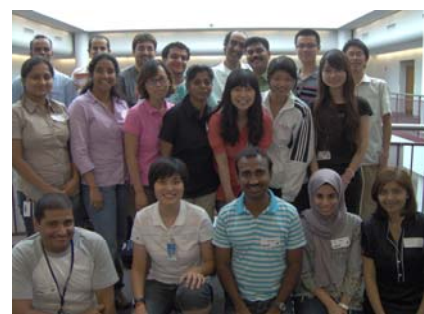
2009 International Students

This year's International Student Orientation included informative presentations and activities designed to familiarize students with the campus, faculty and peers.