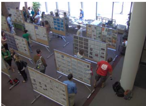
International Showcase posters on Day 1 of the International Health in the School of Nursing Atrium.

Sponsored by the International Affairs Advisory Committee, the Office of International Programs, the Department of Preventive Medicine and Public Health and KU Area Studies Centers, the second annual KUMC International Health Week was held 11-14 April 2011.