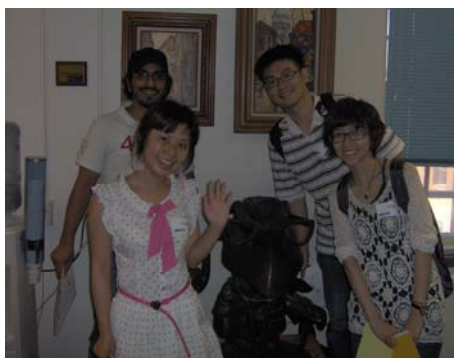
Students posing with JayDoc in the Office of Graduate Studies during the Amazing Race activity.