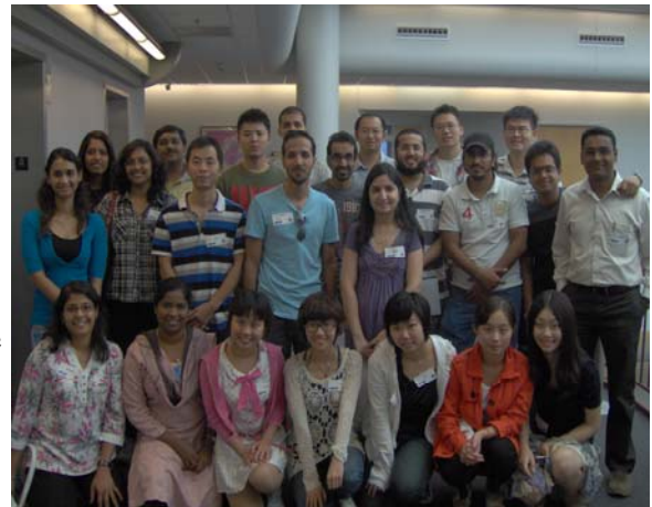
2011 International Student Orientation participants