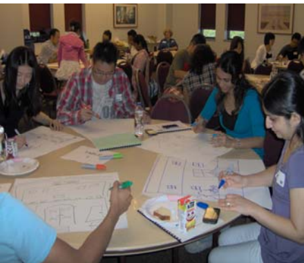
Students participating in the “My House” activity

Thursday morning started off with the “My House” and “Amazing Race” activities. “My House” is a unique way for students to introduce themselves and get to know their fellow international students. Each student is given a large Post-it note and markers. The students are instructed to draw their house or a house that holds special meaning. After the drawing is complete, each student describes their house and a little about