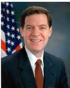
Gov. Sam Brownback Governor, the State of Kansas